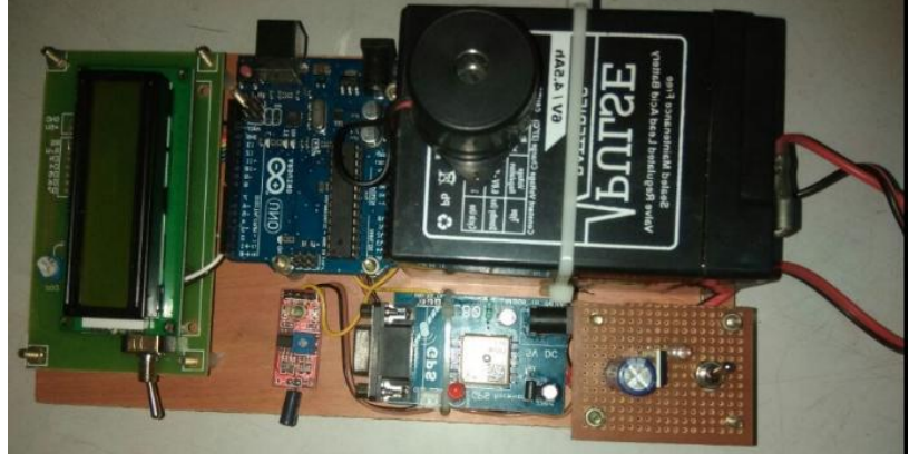
Figure 4. Hardware Design of Module 2

sensor senses it and sends data to the Arduino, The Arduino records the latitudinal and longitudinal direction of the position where the abnormal vibration, if any, is sensed. If the operator happens to travel in the same road again, the GPS data will definitely match with the recorded data in the Arduino. As a result, when the same speed breaker is encountered in future, the operator is alerted by a buzzer sound and also by an alert message in the LCD.