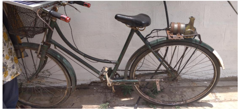
Figure 5. Hardware Setup of Hybrid Electric Cycle

The full hardware setup of the Hybrid Electric Cycle with motor, solar panel and battery fitted in ready to operate in motor drive mode is shown in Figure 5. The hardware setup of the speed breaker detection in the roads and alert system is shown in Figure 6.