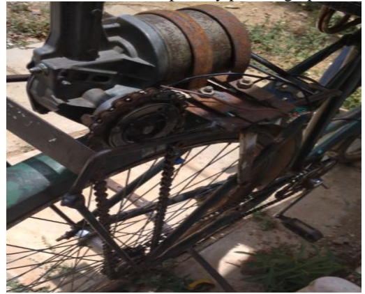
Figure 3. Hardware Design of Module 1

The module 1 has been designed to operate in two modes as shown in Figure 3, normal mode and direct drive mode. In normal mode the motor is fed from the battery. In direct drive mode the motor is fed direct from the PV panel. Initially, the voltage is reduced to 12V using a buck converter and it is stored in a 12V battery. This battery serves as input supply for the wiper motor during normal mode. An ordinary relay switch is used to switchover between the two modes. The operator also has an option for pedaling. Two separate chains are used for pedaling and motoring operation so as to ensure that the motoring operation is never interrupted by pedaling operation.