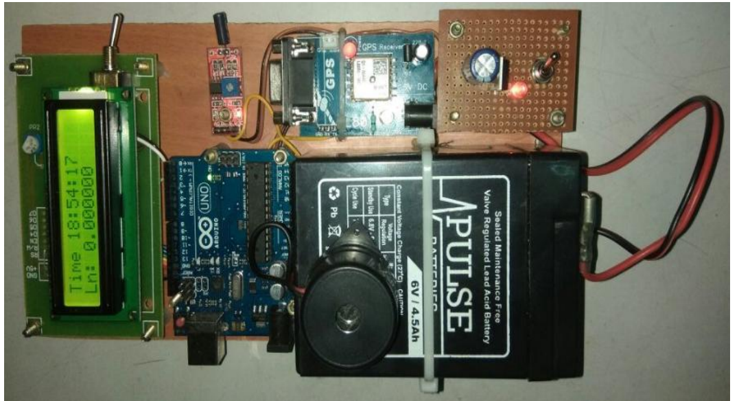
Figure 6. Hardware Setup of Speed Breaker etection System